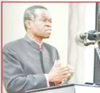
RESOLUTE —Kenyan anti-corruption campaigner Patrick Lumumba delivers a talk