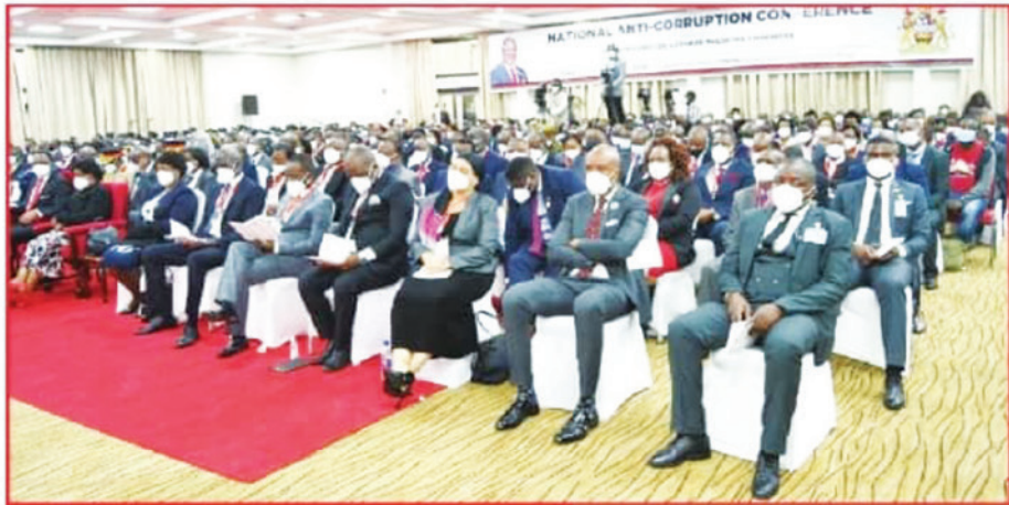
DIVERSE —A cross section of stakeholders attended the launch

P resident Lazarus Chakwera yesterday launched the two-day National Anti-Corruption Conference which he is hosting in Blantyre, with a call for everyone to play their roles in fighting the vice which continues to significantly slow down Malawi's development. Various stakeholders attended the first day of the conference themed 'Resetting the Nation's Moral Tone', as depicted in these.