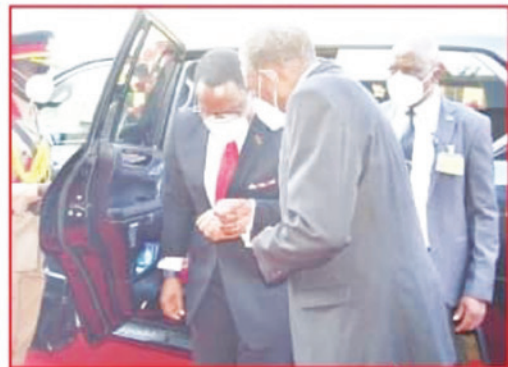
ALL SET —Chakwera arrives at the conference