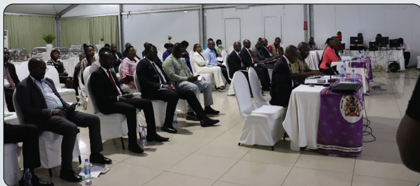
Professionals from different institutions listening to the panel discussion