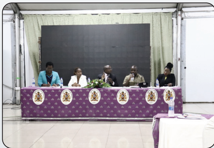
The Panellists addressing the audience

The DG extended her heartfelt gratitude to all participants for taking time to be part of this professional engagement which is hoped to help in advancing the anti-corruption fight. This engagement was part of the 20 weeks anti-corruption campaign which President Dr. Lazarus McCarthy Chakwera launched on the 26th of July 2022.