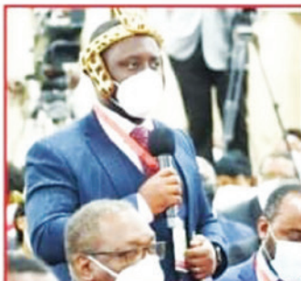
FOR CLARITY —Inkosi Gomani V asks a question during a panel discussion