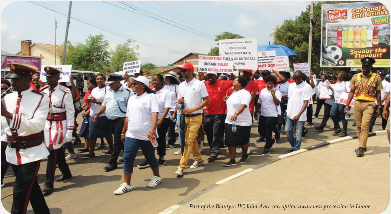
Part of the Blantyre IIC Joint Anti-corruption awareness procession in Limbe.