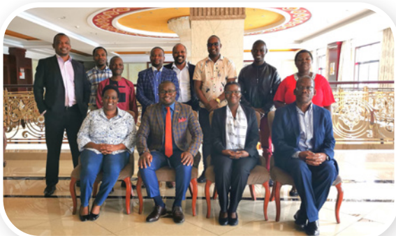
The DG poses with the media Managers and Chairperson of the media Council of Malawi

The ACB continues to emphasise how all pillars together are key to fighting corruption and how they are all important in the fight.