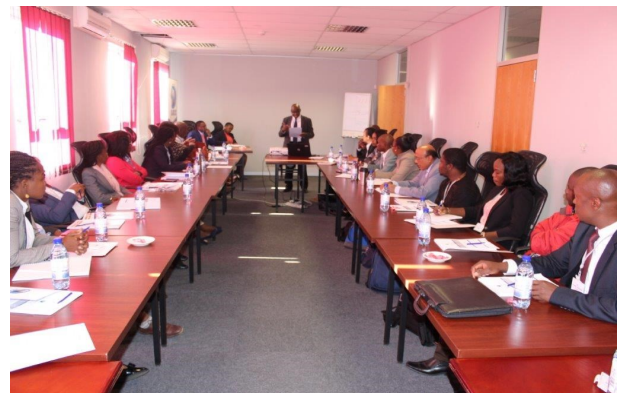
BOTSWANA TRAINING IN SESSION