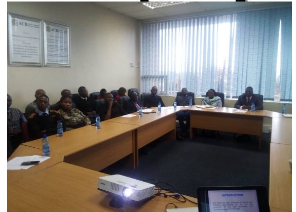
ICT SENSITIZATION IN PROGRESS

The ICT policy for the ACB was launched in March this year in Mangochi. The sensitization of the policy was done on regional level during the month of July. For example, Lilongwe had their sensitization on 17th July, 2019. All officers were supposed to sign to the adherence of the policy.